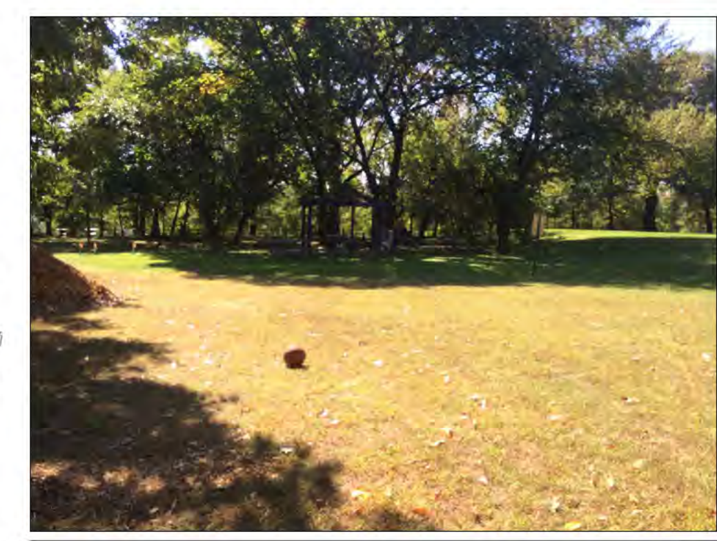
PROPOSED LOCATION FOR NEW 5-12 PLAYGROUND