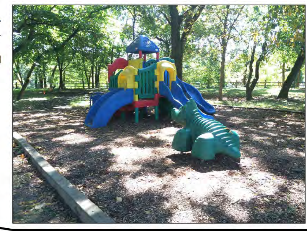
EXISTING TOT LOT PLAY EQUIPMENT TO BE REPLACED IN EXISTING LOCATION, PRESERVE EXISTING TREES