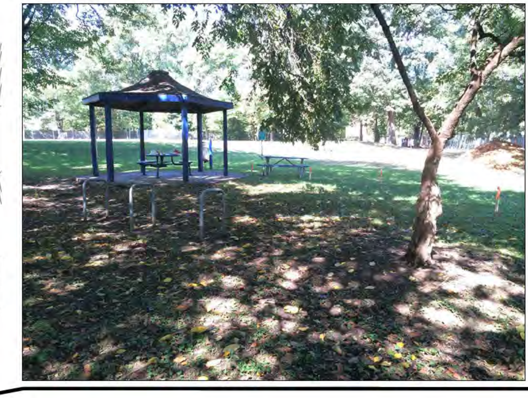
EXISTING GAZEBO IN POOR CONDITION TO BE REPLACED, ACCESSIBLE PICNIC TABLE TO BE INCLUDED