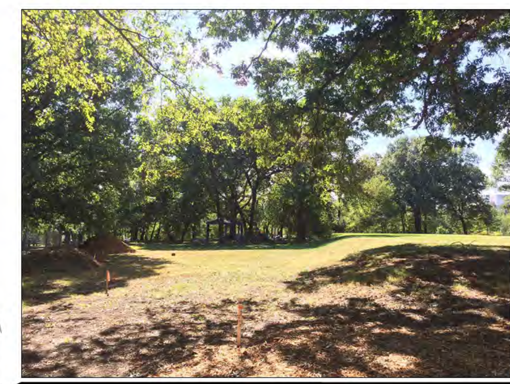
EXISTING SOCCER FIELD AND STEEP SLOPE - STORMWATER MANAGEMENT MEASURES REQUIRED TO ADDRESS DRAINAGE FOR FIELD AND PROPOSED PLAYGROUND