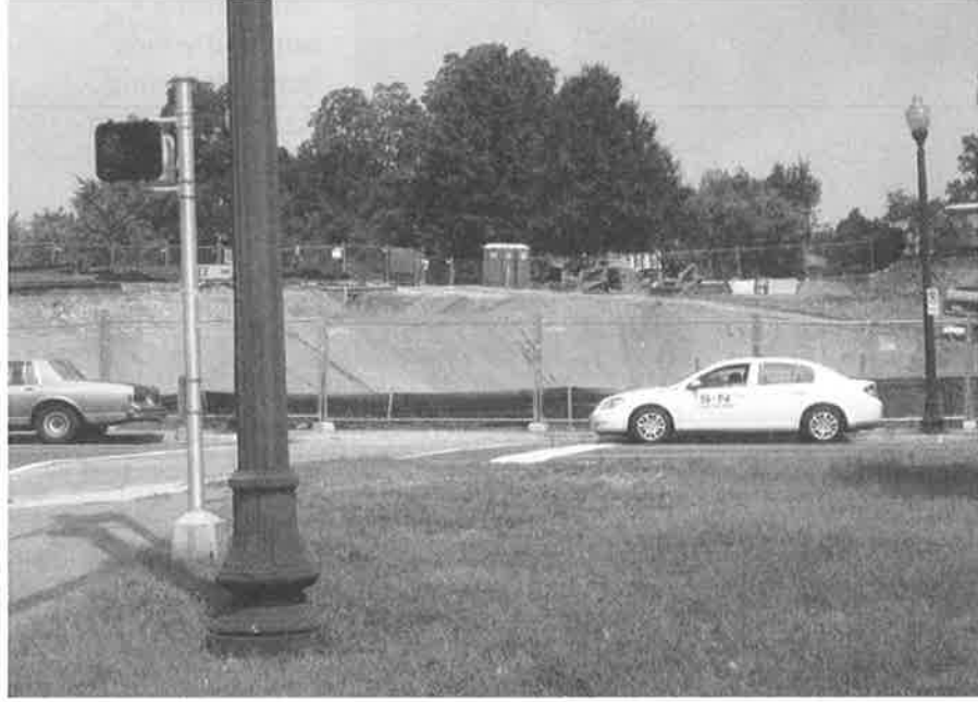
Left: The intersection of N. Monroe St. and Lee Highway. Some residents of Maywood and Cherrydale have recommended that the developer of the new condominiums (you can see the excavation for the new structure in the background of this photo) use the existing water pipe in the median strip to supply water to a proposed fountain located to the right of the light pole in this photograph.