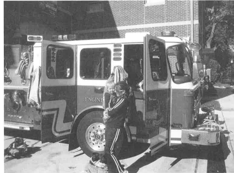
Left: A mother helps her child down from the cab of an Arlington County Fire Department pumper at the new Fire Station 3 during the Stations' open house on October 15th.

To Enhance the psychological and physical well-being of people by helping extend the length and quality of their pets' lives, thereby preserving the human-animal bond.