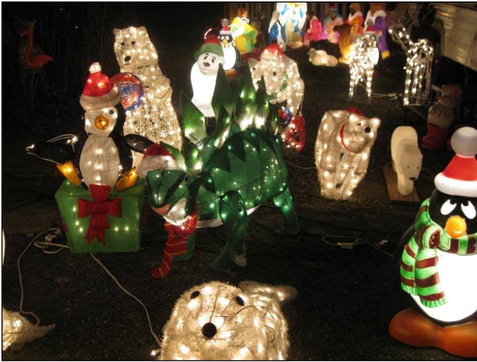
The Springston "Christmas House," yard decorations add Christmas cheer to the neighborhood.

Every Cherrydaler knows about the "Christmas House" on North Quebec Street. Many of us make a pilgrimage to see it each year. Holiday decorations, ornaments, and lights cover the house and fill the yard with a glow that can be seen a block away. Newcomers want to know more about the family that makes this fabulous display happen every year.