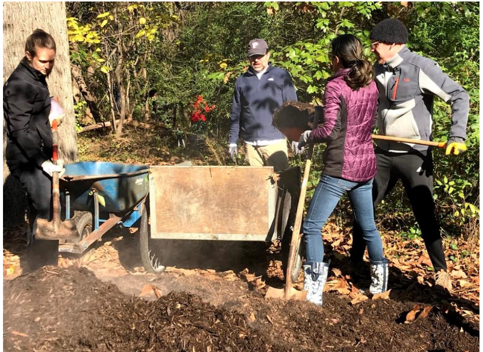
Cherrydale residents and church-goers volunteer at the Cherry Valley Nature Area, November 2.