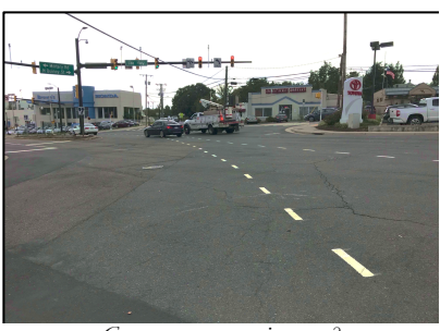
Can you see oncoming cars? The new crosswalk?

3. The new left turn patterns for cars turning left from Military Road onto Lee Highway and from Quincy Street onto Old Dominion is also reducing traffic flow through the intersection. The new pattern allows far fewer left-turning cars to clear the intersection before the light turns red, and also causes a queue of left-turning cars that have already entered the intersection from Military Road to remain in the intersection after the left arrow for westbound cars on Lee Highway turns green, further reducing the number of cars that can turn left from westbound Lee Highway onto either Quincy Street or Old Lee Highway. This also poses a hazard to pedestrians in the new crosswalk on Lee Highway. We are requesting that the County restore the long-standing left-turn pattern for Quincy Street and Military Road and place signs to so indicate.