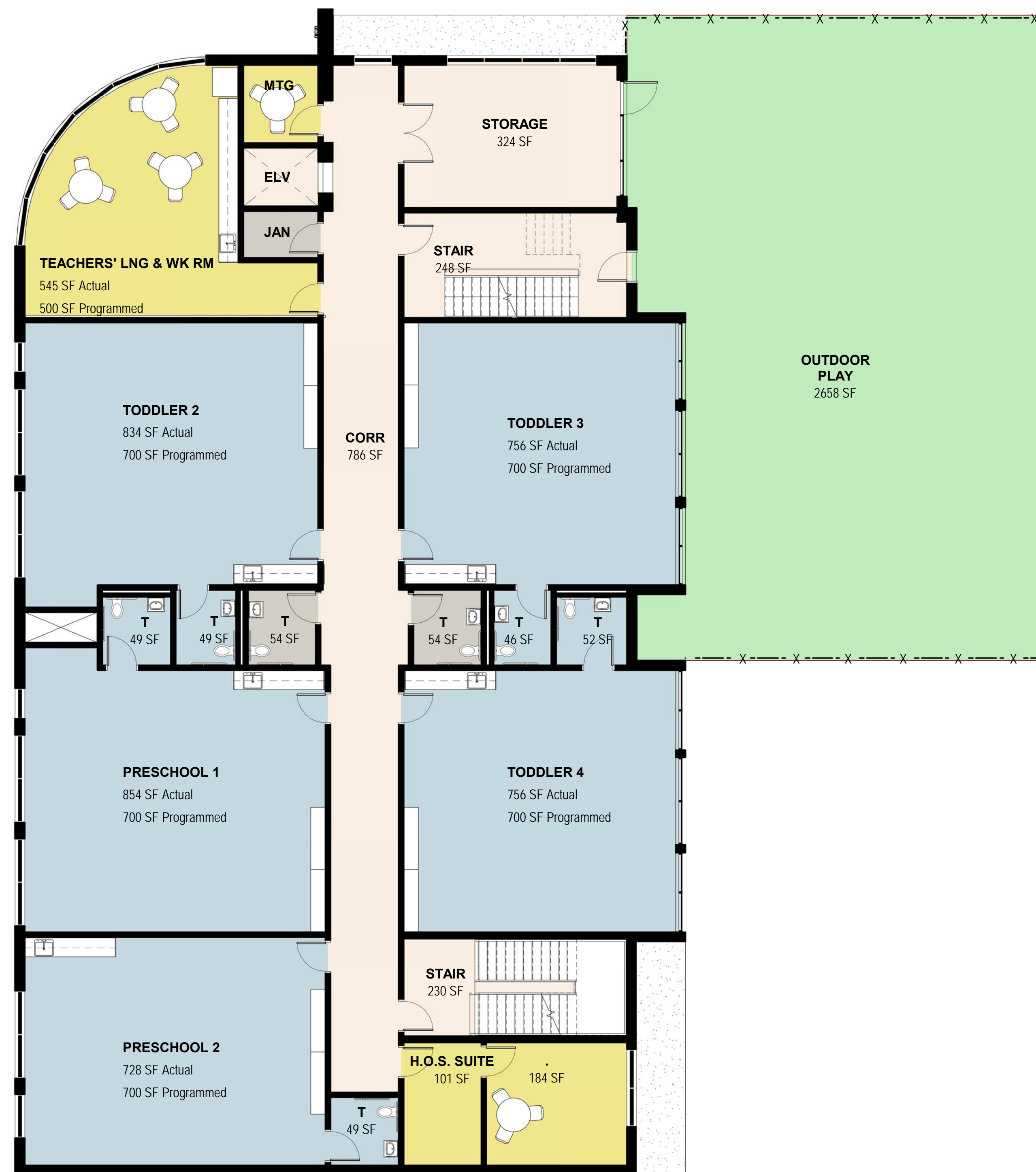
SECOND FLOOR 1/8" = 1'-0"