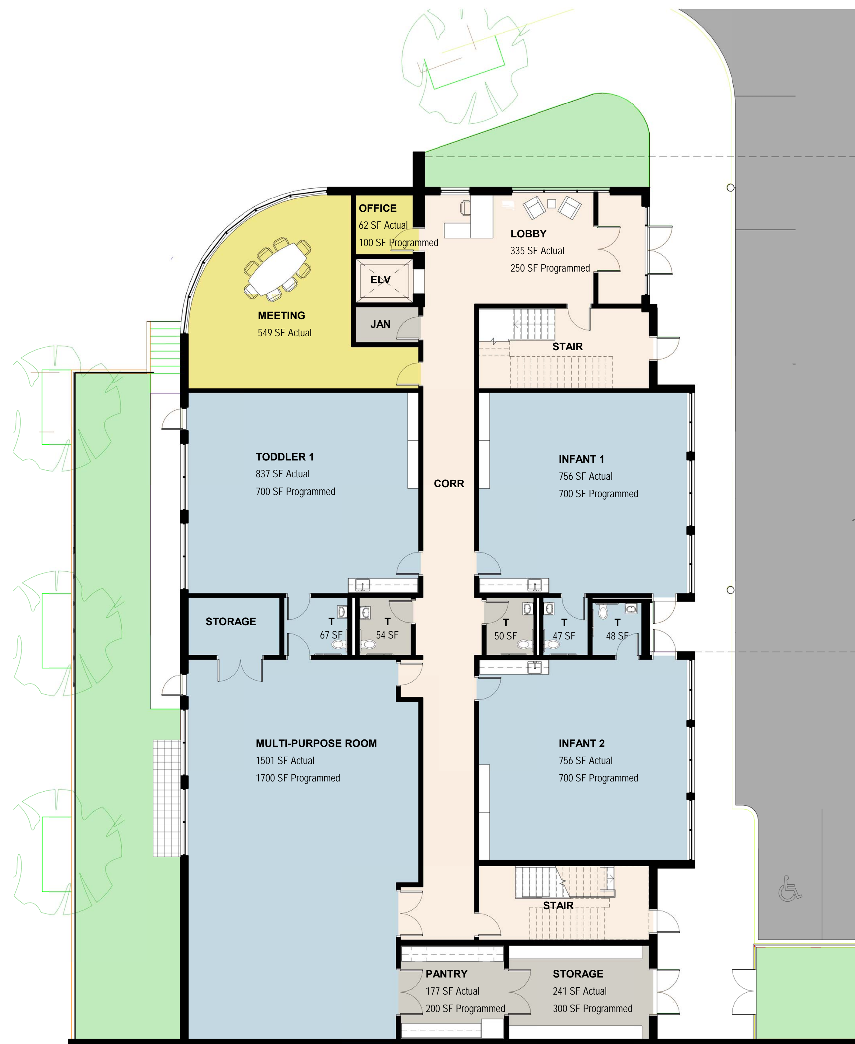
FIRST FLOOR 1/8" = 1'-0"