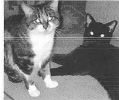
Ruby and Mojo, newly adopted from Arlington Animal Welfare League

ALL YOU ANIMAL LOVERS, please tell ten friends to tell ten today! The Animal Rescue Site is having trouble getting enough people to click on it daily to meet their quota of getting free food donated every day to abused and neglected animals.