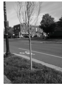
Cherrydale Tree