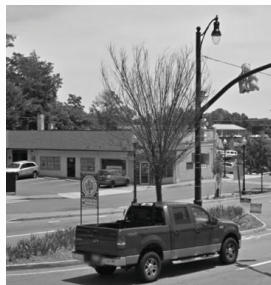
Cherrydale Tree