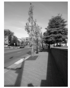
Cherrydale Tree