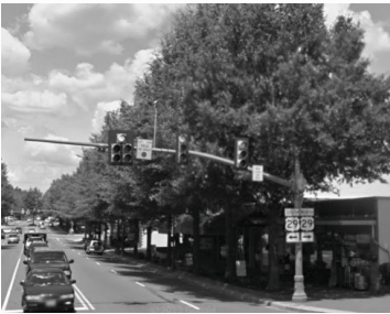
Falls Church Trees