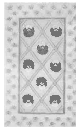
Sumptuous Vivid Pansy Style, Chinese Sumack 100% wool 5x7 rug by McKenzie-Childs.