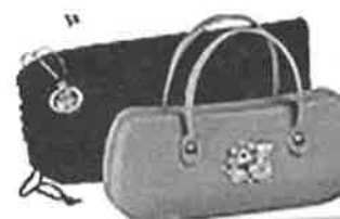
Hand-bags & "clutch" purses too!