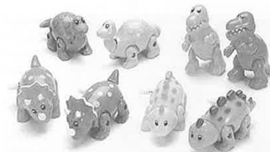
Somersaulting wind-up animals, others for fun as stocking-stuffer. At right, flower sink scrubber for Dad's stocking! Below, "Desserts" actually are towels adroitly folded by Japanese supplier, $8.50 and up.