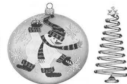
A wide variety of ornaments, frosty glass beauties, silvered glittering themes, delightful shapes and sizes to suit anyone's tree!