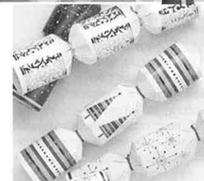
"Crackers" start festive fun with a bang!