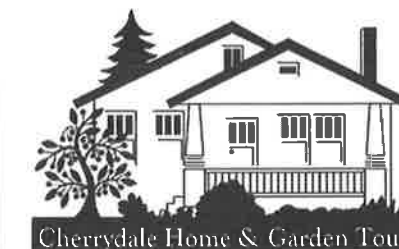
Cherrydale Home & Garden Tour