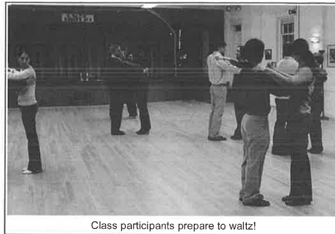
Class participants prepare to waltz!

me, and wavin' my hands in the air to show there's a "party over here" and a "party over there" ... Hey! Ho! Hey! Ho!