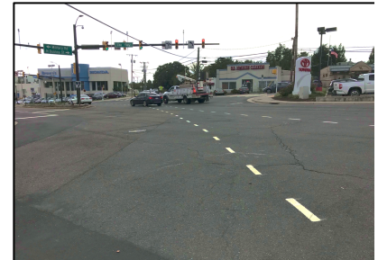
Can you see oncoming cars? The new crosswalk?

3. The new left turn patterns for cars turning left from Military Road onto Lee Highway and from Quincy Street onto Old Dominion is also reducing traffic flow through the intersection. The new pattern allows far fewer left-turning cars to clear the intersection before the light turns red, and also causes a queue of left-turning cars that have already entered the intersection from Military Road to remain in the intersection after the left arrow for westbound cars on Lee Highway turns green, further reducing the number of cars that can turn left from westbound Lee Highway onto either Quincy Street or Old Lee Highway. This also poses a hazard to pedestrians in the new crosswalk on Lee Highway. We are requesting that the County restore the long-standing left-turn pattern for Quincy Street and Military Road and place signs to so indicate.